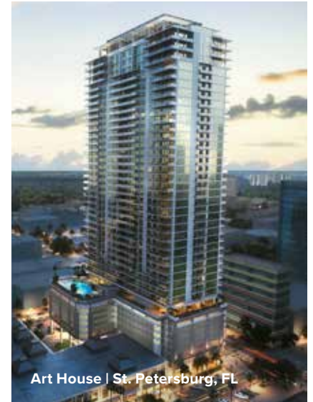
Art House | St. Petersburg, FL