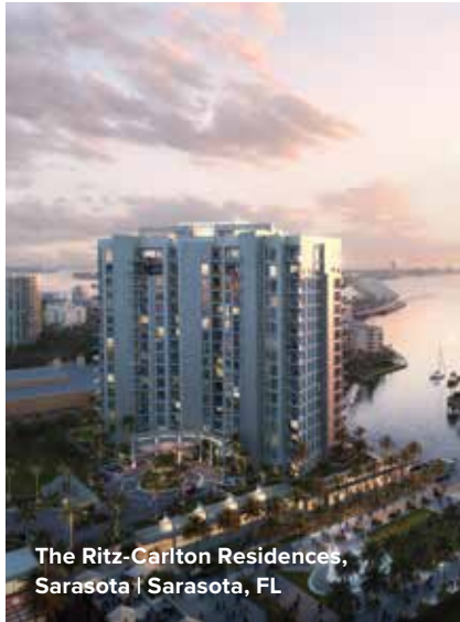
The Ritz-Carlton Residences, Sarasota | Sarasota, FL