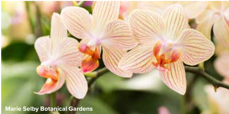
Marie Selby Botanical Gardens

The Ritz-Carlton Residences, Sarasota Bay is ideally located in the heart of Sarasota, renowned as the cultural capital of Florida's west coast. A tropical paradise rich in arts and entertainment, coastal beauty, boating, and beaches, Sarasota brings sunshine, palm trees and bay breezes together with world-class museums, art galleries, performing arts halls, and botanical gardens, with every imaginable convenience nearby.