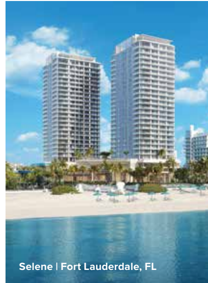
Selene | Fort Lauderdale, FL