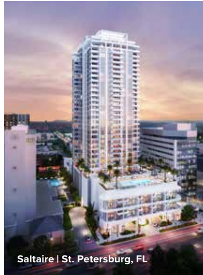
Saltire | St. Petersburg, FL