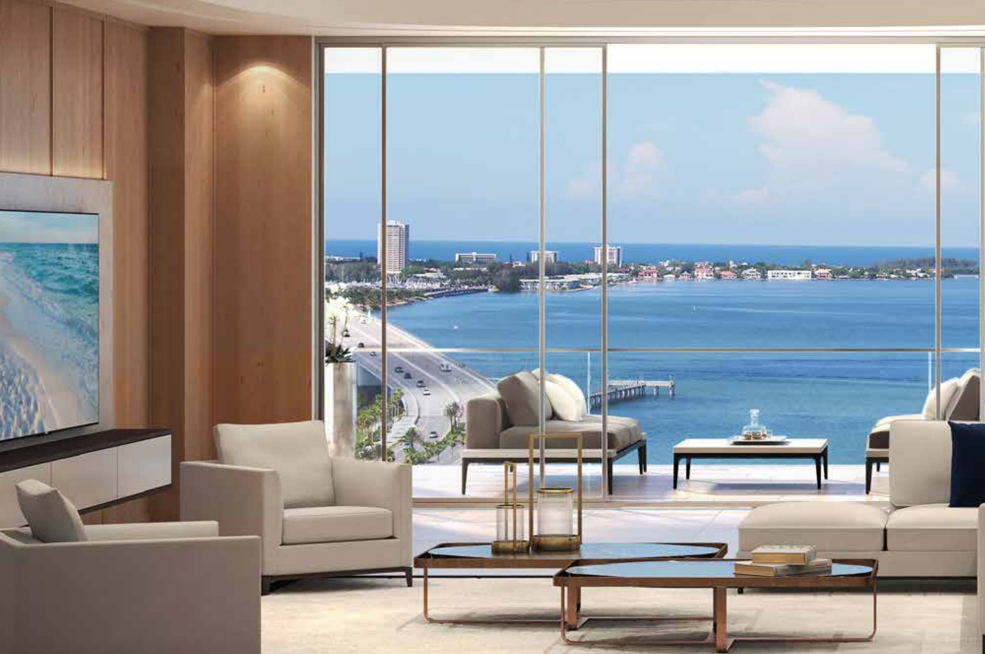
The Ritz-Carlton Residences, Sarasota - Worthington Residence