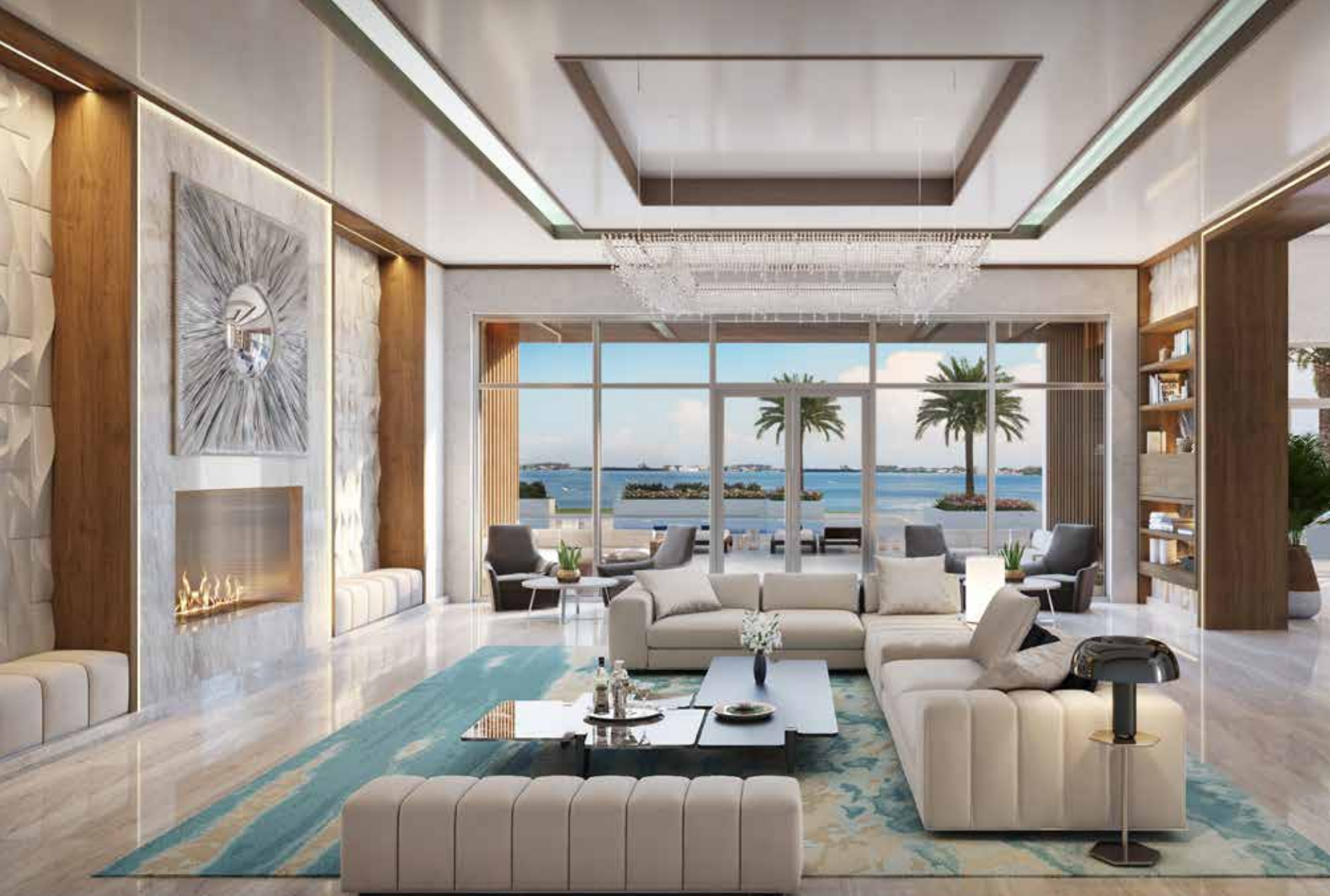
The Ritz-Carlton Residences, Sarasota - Grand Salon