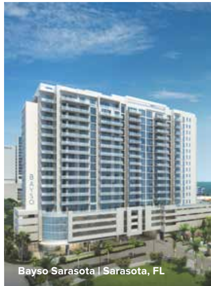
Bayso Sarasota | Sarasota, FL