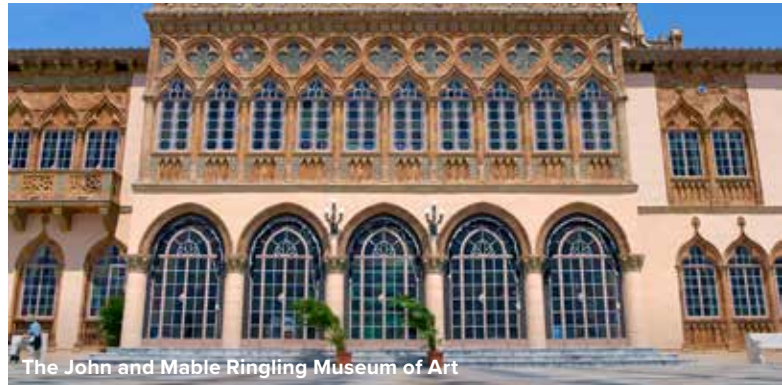
The John and Mable Ringling Museum of Art