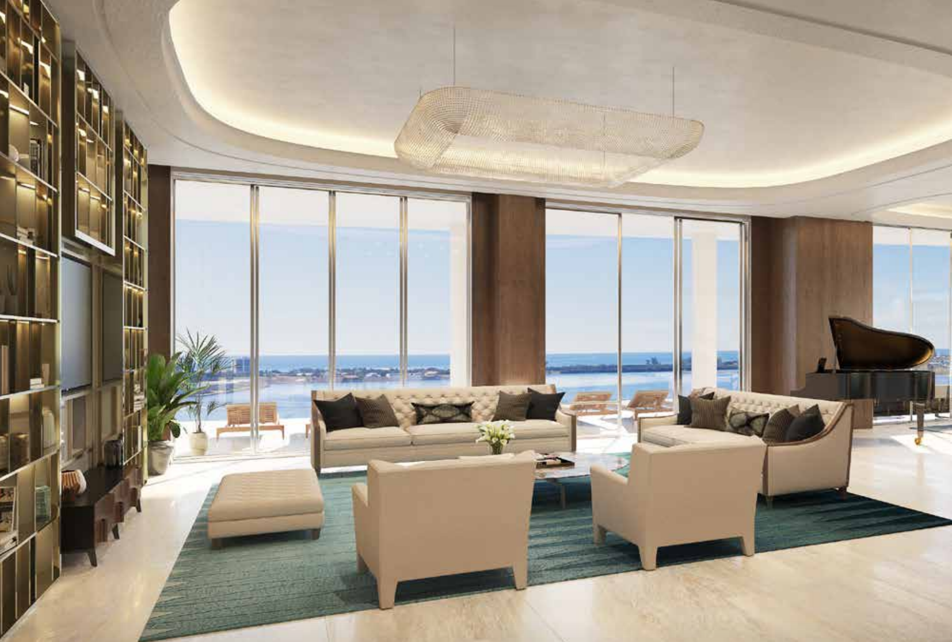
The Ritz-Carlton Residences, Sarasota - Penthouse Residence