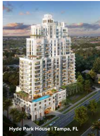
Hyde Park House | Tampa, FL